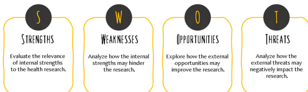
Figure 2. Adapted SWOT analysis for health research.

The adapted SWOT analysis was developed following its basic principles, which were incorporated into the research. The analysis begins in the early stages of research planning and goes up to the peer-reviewed stage. Figure 2 summarizes the idea, and each phase is detailed below.