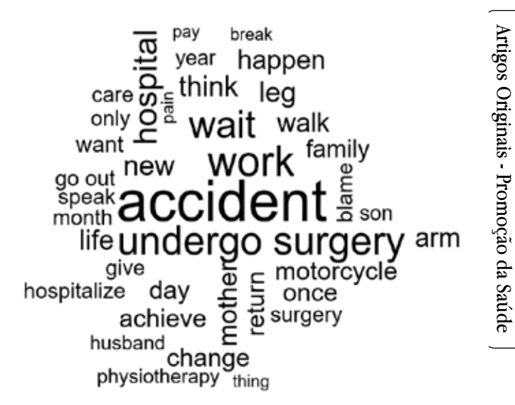
Figure 2. Word cluster consequences of the accidents.

"I have nightmares and frequently I feel angry for the driver who ran away from the accident. He cut me off when he tried to exceed" (I 01; male; 54 years old; incomplete higher education).