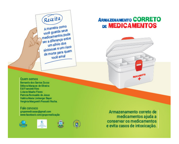
Figure 2 shows PEM validated by judges/health professionals and users after changes.

Modifications comprised replacement of the term 'preserve' by 'conserve' on the cover; the substitution of full stop in the phrases of p. 2 instead of semicolon; increase size of freezer of the refrigerator; replacement of illustration of sink by illustration of a more simple closet with a simple sink and mirror with built-in cabinet. Space for comments and suggestions were tools for the inclusion of contents for certain important items which validation did not insert.